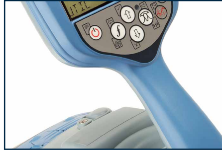
Li-lon battery pack Lithium-Ion rechargeable battery options for both locator and transmitter provide extended