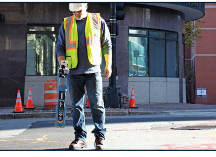
On-site monitoring Integrated GPS and multi-rate automatic usagelogging allow managers to review locate history to ensure compliance with best practice.

4 kHz frequency with Current Direction for locating and tracing higher impedance cables over longer distances