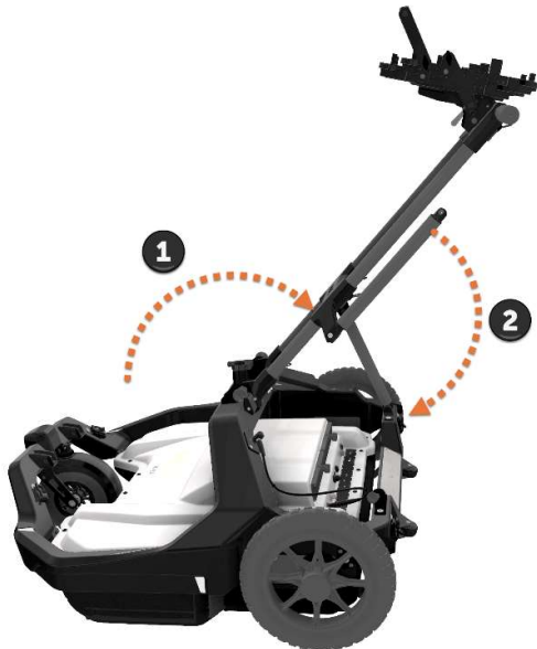
Figure 3. Flip the handle up and lower the support arms.