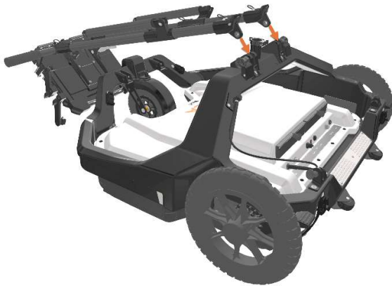
Figure 1. Attach handle to the frame.