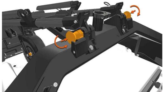
Figure 2. Lock the plunger by rotating the knobs and pushing them in.