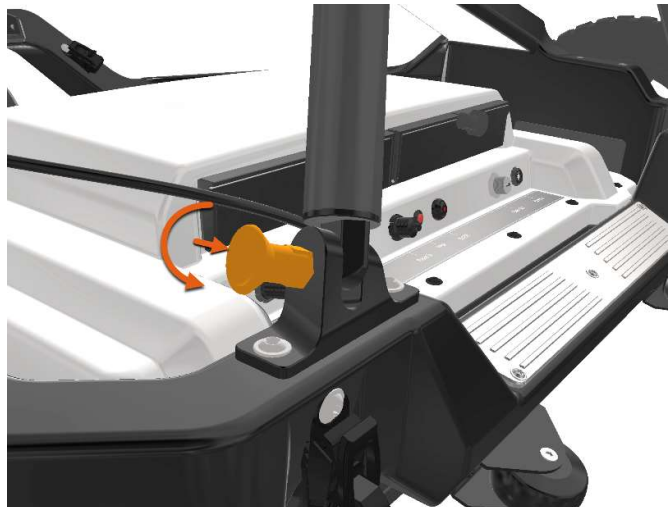
Figure 4. Lock the plunger by rotating the knobs and pushing them in.

Mount your laptop securely on the laptop holder, use the included Havis owner's manual for adjustment instructions. Use the quick-release mechanism to secure the GNSS antenna or Total Station prism. If using a longer pole, it is recommended to use the MALÅ GNSS support arms for stability (optional accessory). Make sure the encoder cable is connected between the antenna box and the frame. Connect the ethernet cable between antenna and laptop. If needed, connect the included USB-C cable for charging your laptop or GNSS antenna.