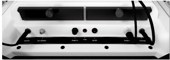
Figure 5. Battery compartments and connector panel

Press the On/Off button to start the MIRA Compact. Wait for a steady light; the system is now ready to be connected to the MIRA Controller software. To power off, press and hold the On/Off button for 3 s.