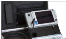
Adjustable viewing angle