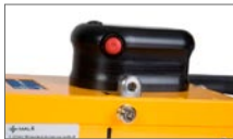
In-built antenna controls